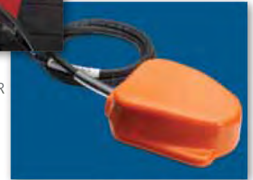
OPTIONAL FOOT SWITCH FREES UP HANDS MAKING TURNS EVEN EASIER TO HANDLE