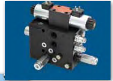
PWM STEERING VALVE HELPS ENSURE A SMOOTH RIDE AND ACCURATE PERFORMANCE

OmniSTAR®, CORS or base station RTK solutions: See page 21