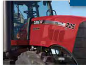
DIRECT-CONNECT AUTO-STEER CAPABILITY FOR SELECT VEHICLES GREATLY SIMPLIFIES INSTALLATION